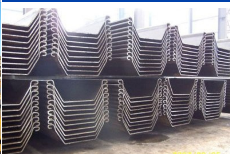
INTERLOCK SHEET PILE